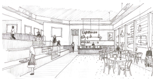
An interior view looking into the foyer, demonstrating the stepped seating arrangement leading up to the worship space to the left, with a public cafe at the centre of the space.