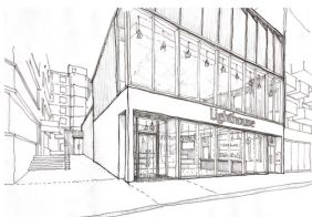
A view on the approach of the proposed building, looking at the main and secondary entrances.

After 10 years we took the hard decision to lay down the LH development in its full format. Inflation, COVID delay, legal and Diocesan permissions, funding shortfalls all led to this decision. The core prayerful support group had a time to reflect and pray on a special zoom meeting. This was sad and disappointing, and I want to express on behalf of the whole church deep thanks for those who invested in the scheme so generously. The first scheme turned out to be just too much for us, but we all recognised that our Living Father works for the good in all things, and that the calling to develop our space has not altered- this is both to develop our frontage to be accessible and visible, to make our building fit for 21st C purpose, and to expand our available spaces for ministry; so LH Development 2.0 has risen using much of the knowhow from LHD 1.0- and we are in the initial stages of a new scheme aligned to the funding in our hands - more on this to follow! Again a massive thank you to all those who are carrying over their funding to the new scheme.